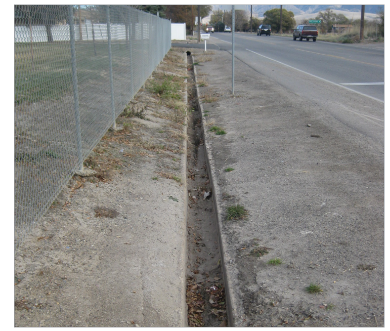
Open Drainage Facilities