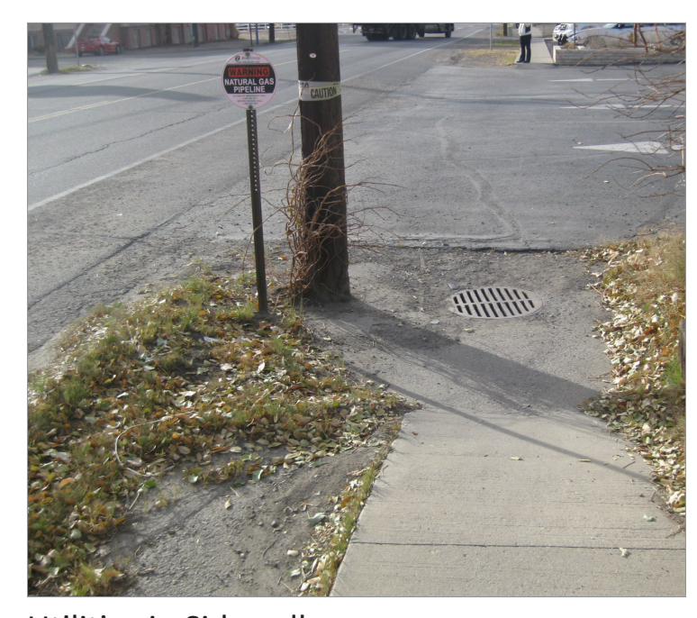
Utilities in Sidewalk