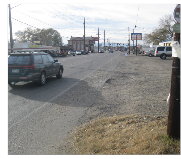
Uncontrolled Property Access