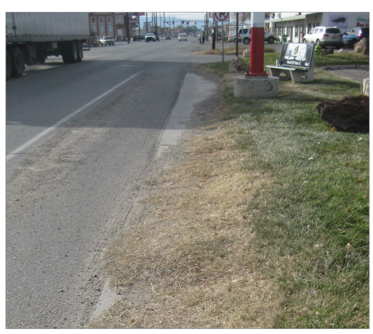
Poorly Maintained Sidewalk