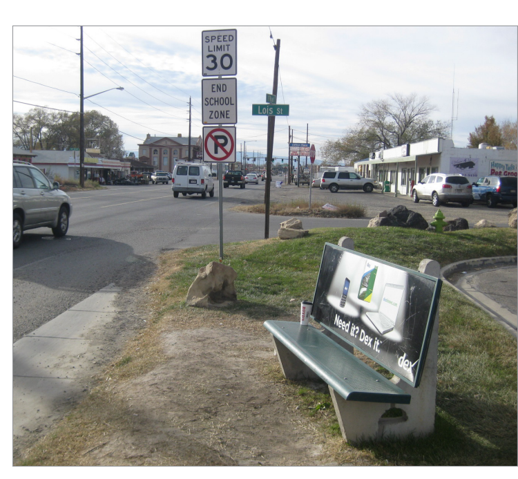
Lack of Bus Stop Connections