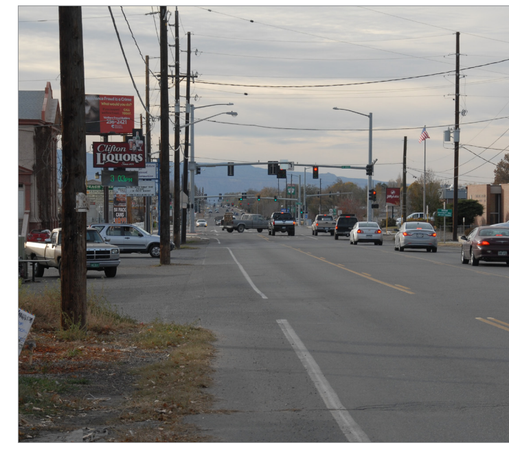
Overhead Utility Poles close to Roadway