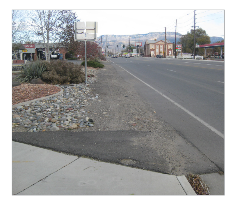
Missing Sidewalk Connections